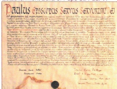
Декрет Папи св. Павла VI про заснування

502 Fifth Avenue • New Westminster, British Columbia • V3L 1S2 • Canada email: bishop@ucatholic.ca tel.: 604-524-8824 web: www.nweparchy.ca