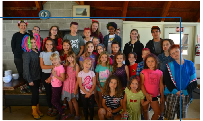
Crazy hair Theme day