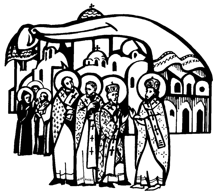
Sunday of the Nicean Council Fathers John 17:1-13

Неділя Святих Отців Нікейського Собору Йоана 17:1-13