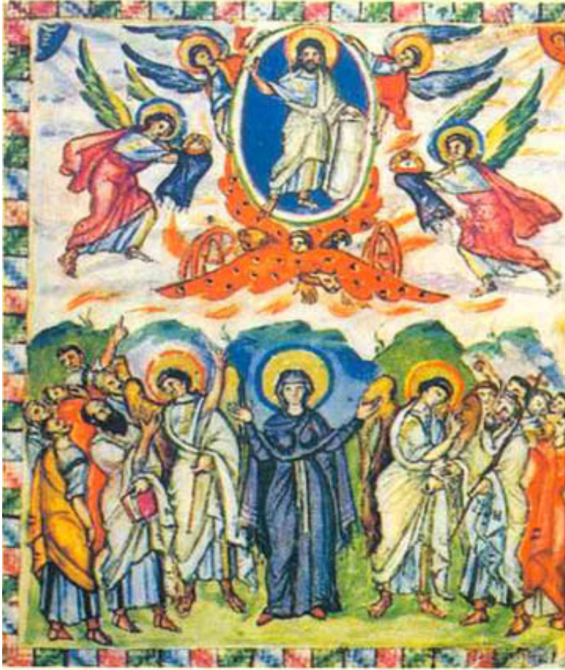
ASCENSION OF THE LORD JESUS Rabbula - 6th c.

The Scriptural descriptions which serve as a basis for the icon illustration of the feast of the Ascension of our Lord are rather sparse. The Gospel of Mark 16:19 tersely states that: “the Lord Jesus was taken up into heaven and took his seat at God’s right hand.” In the Gospel of Luke 24:50 we learn that the Ascension took place in Bethany, that Christ has his hands upraised and blessing the disciples. Luke in Acts of the Apostles 1:9-12 simply describes the Ascension of our Lord as taking place on the fortieth day after His Resurrection after appearing and speaking about the reign of God: “He was lifted up before their eyes in a cloud which took Him from their sight.”